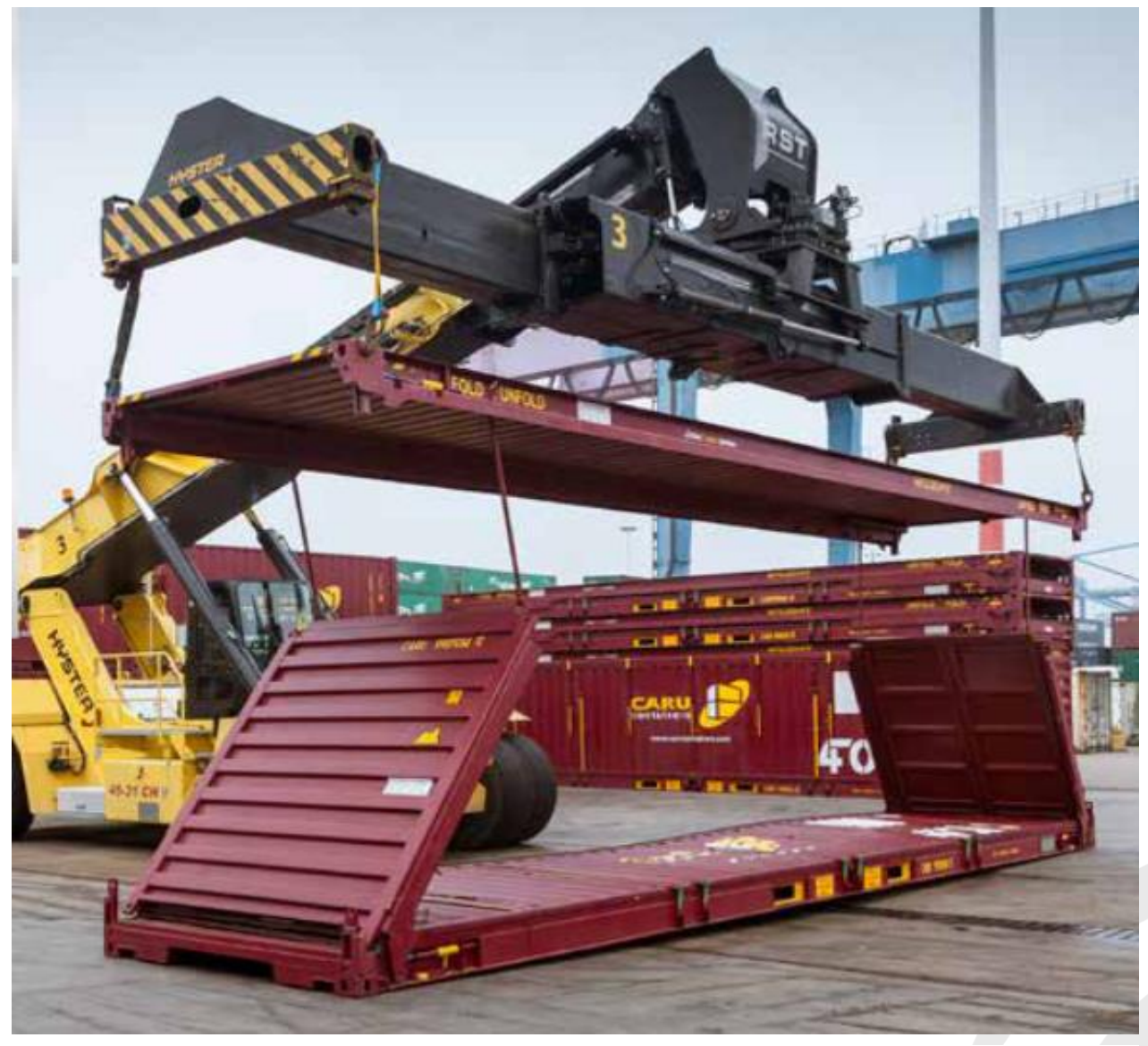
Figure 1 4Fold Container

This is because the same number of resources are needed in the logistics chain to transport loaded and empty containers. "We can solve part of this imbalance, or at least the inefficiency of "air transport," claims Hans Broekhuis, CEO of Holland Container Innovations, also known as 4Fold.