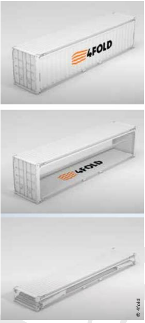
Figure 2 4Fold Container

This "bundle" is already certified and can be used, loaded and secured in exactly the same way as a normal standard container. Due to the high flexibility of the bundling options, Staxxon containers can be seamlessly introduced into already existing logistics processes. Folding itself should not be a bottleneck, that is important to the company. An automated process allows folding in under three minutes. Manual folding is also possible, with a trained two-man team needing just ten minutes per container. The model is scheduled to go on the