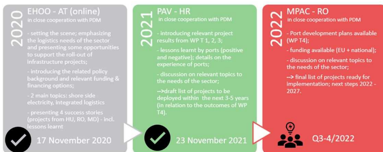
Figure 2: Danube Ports Day 2022

The key topics of the second edition will focus on relevant project results achieved so far in the thematic work packages T1, T2 and T3. Based on the experience gained in the framework of the first and second editions, the third edition will further discuss relevant topics in terms of concrete needs and requirements of the IWT sector with a special focus on port development issues. Lessons learnt as well as success stories will be included on the agenda of the Danube Ports Day 2022. The following figure, highlighting the third edition of the event, provides a detailed overview: